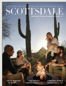
Meeting & Travel Planners Guide